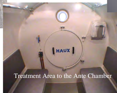
Treatment Area to the Ante Chamber