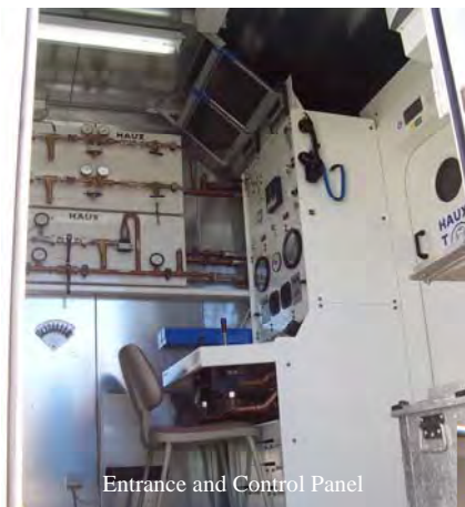
Entrance and Control Panel

equipped with Spray Fog Fire Fighting System