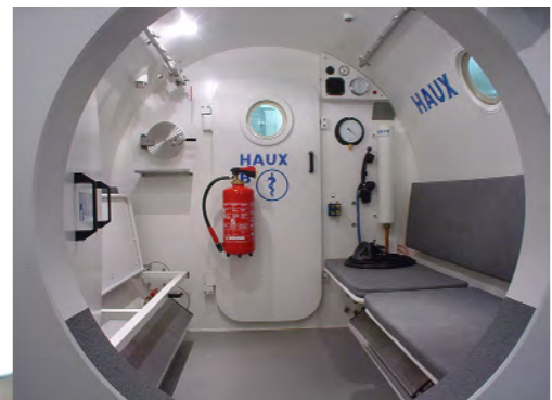
Treatment Area to the Entrance