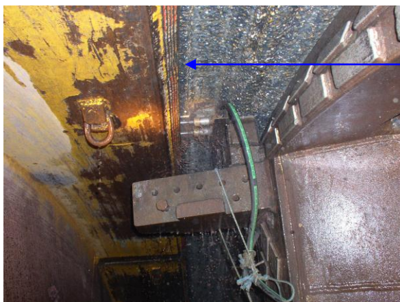
cutting of concrete in a tunnel boring machine