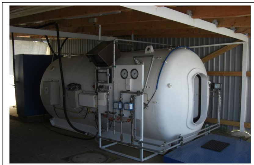
The Hyperbaric Chamber for Research and Training

Because welding in compressed air becomes more and more interest in Caissons and Tunnel Boring Machines, Nordseetaucher GmbH has started in the beginning of the year 2010 a research and training program in co-operation with the Germanischer Lloyd, Germany and some manufacturer for welding electrodes and wires.